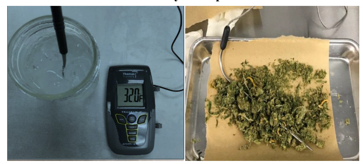
Water activity / Temperature